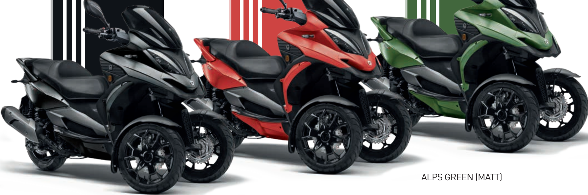
RAW BLACK (MATT)